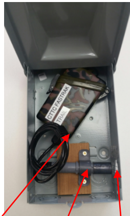
Plastic Electronics Case